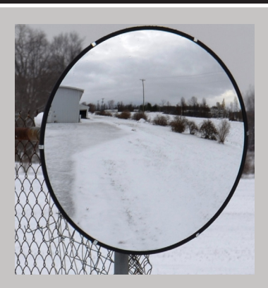
Model PLXR-30 and PLXR-26